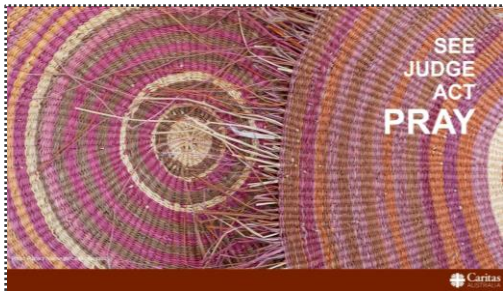
Image: Pandanus weavings made by artists at Djilpin Arts.