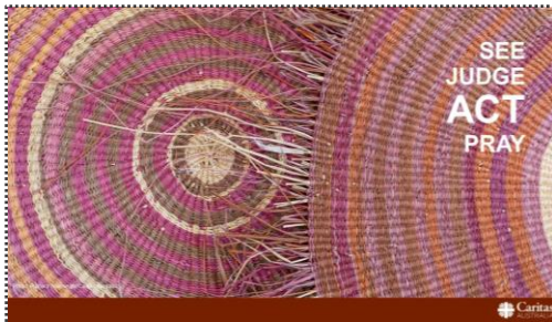
Image: Pandanus weavings made by artists at Djilpin Arts.