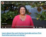
Learn about the work Caritas Australia and our First Australian partners are doing.

Watch Caritas Australia's Programs Snapshot: First Australians video. How are these Caritas Australia-supported partners and programs helping First Nations individuals and communities?